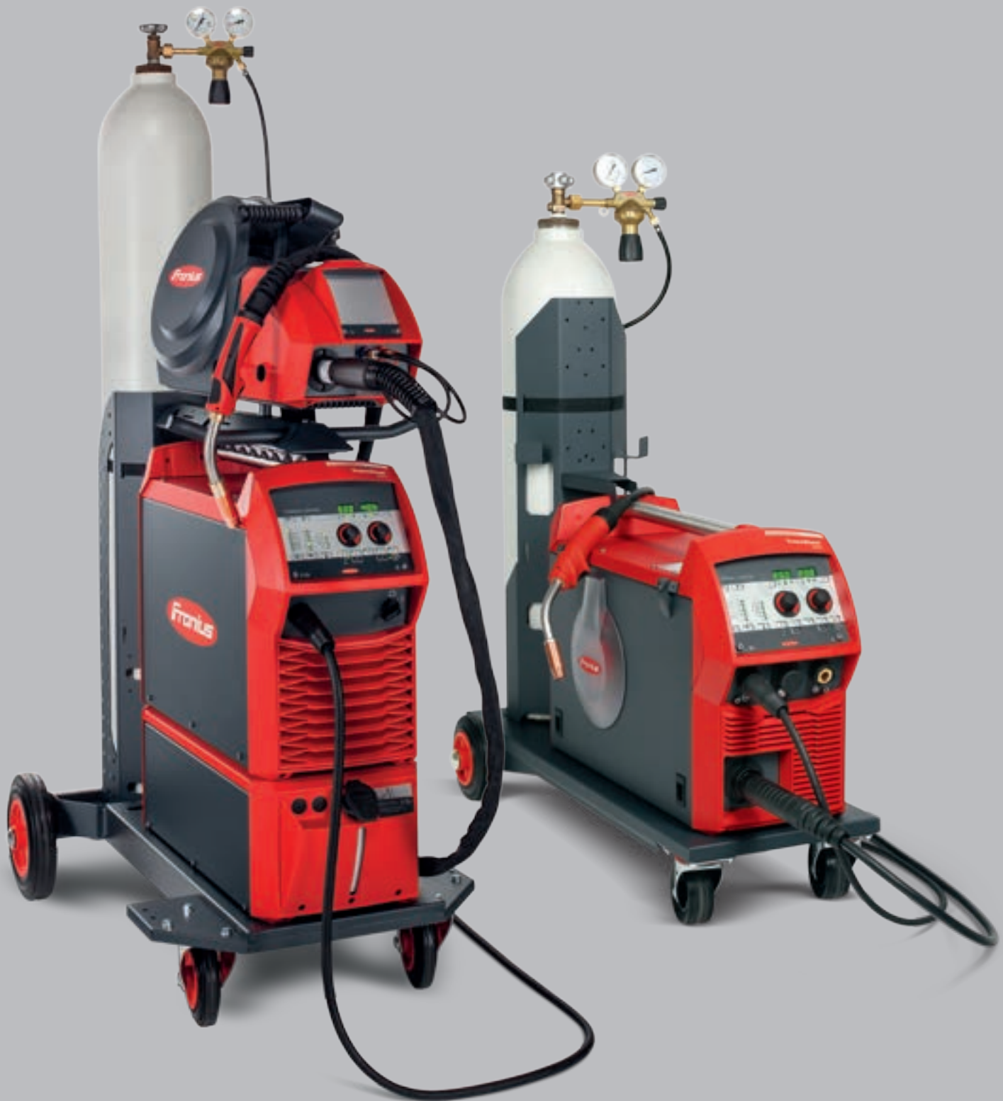
TRANSSTEEL 3500 SYN / TRANSSTEEL 5000 SYN